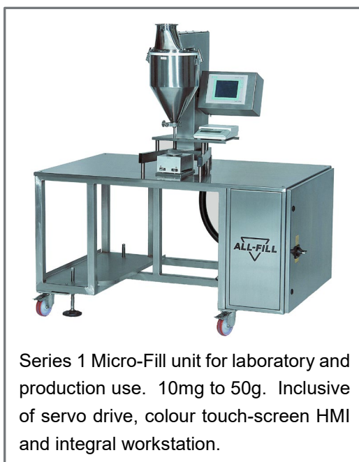
Series 1 Micro-Fill unit for laboratory and production use. 10mg to 50g. Inclusive of servo drive, colour touch-screen HMI and integral workstation.

Floor-standing pedestal and bench-top models are available in volumetric and gravimetric forms, with all 316L stainless steel contact parts, no-tools strip-down for cleaning and 304 stainless steel externals. All machines feature PLC control via colour touch-screen panel.